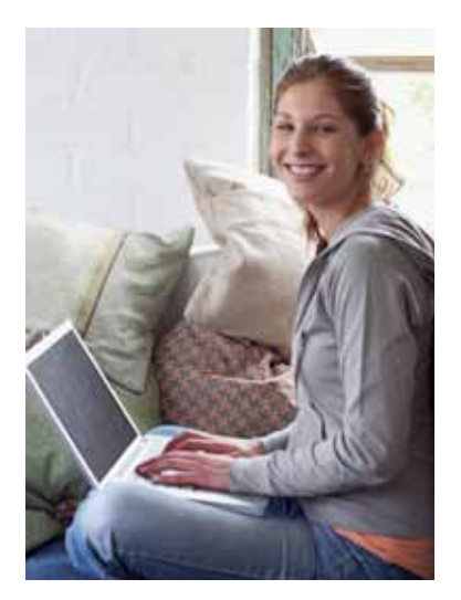
ornerstone Group © 20

Good luck to all students, parents, and teachers during this upcoming school year!